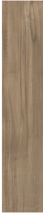
SAND DUNE K##-802