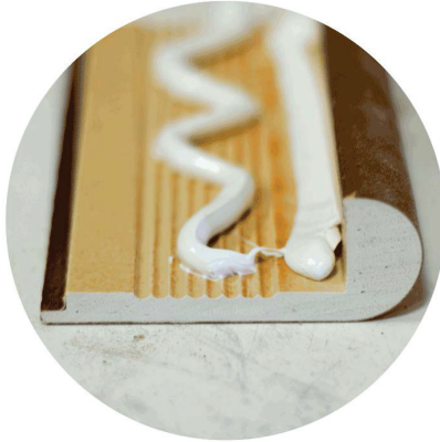
STAIR NOSE FLUSH