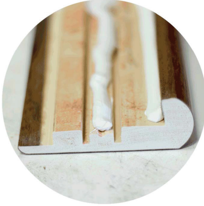
OVERLAP STAIR NOSE