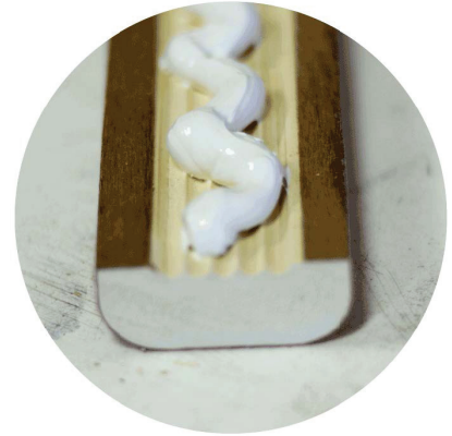
STAIR NOSE MINI