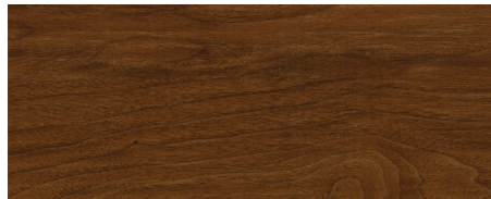
Burnt Sunset HC1070