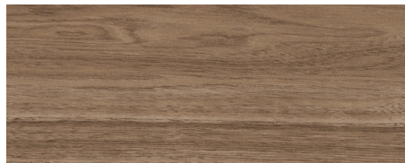
Caramel Syrup HC1110