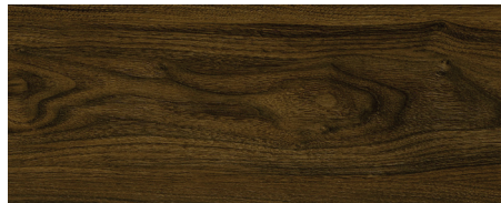
Deep Coco HC1020