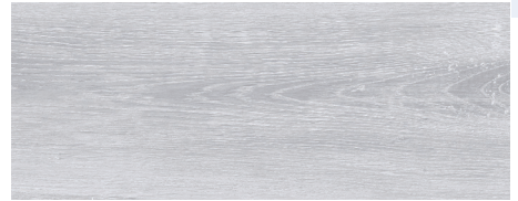
Clear Pearl HC1100