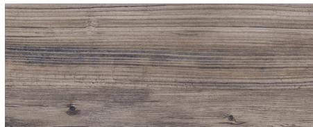
Early Dusk HC1040