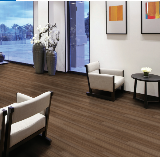
NovaClic FD® Floating Installation System

HushCore's high performance construction and protective Cobalt Guard finish provides superior resistances to scratching, scuffing, and indentations while helping hide minor substrate irregularities. With a LIFETIME residential warranty and a 10-year commercial warranty, HushCore is the perfect solution for your flooring needs.