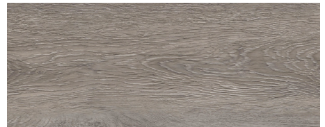
Iced Silver HC1010