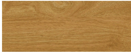
Honey Sand HC1080