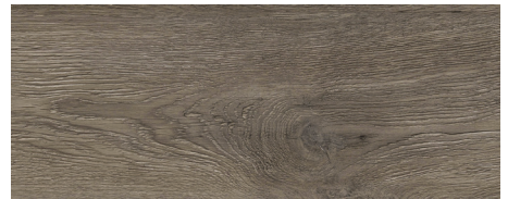
Coarse Pewter HC1060