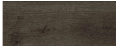
Steel Taupe HC1090