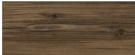
Roasted Peanut HC1050