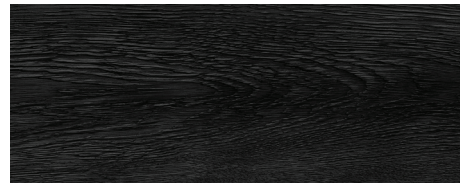
After Midnight HC1000