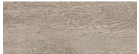
Cool Greige HC1030